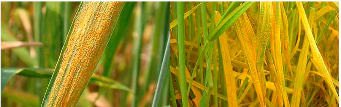
Plate 3 : Yellow rust attack