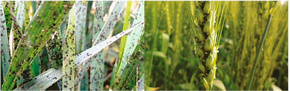
Plate 2 : Aphid attack