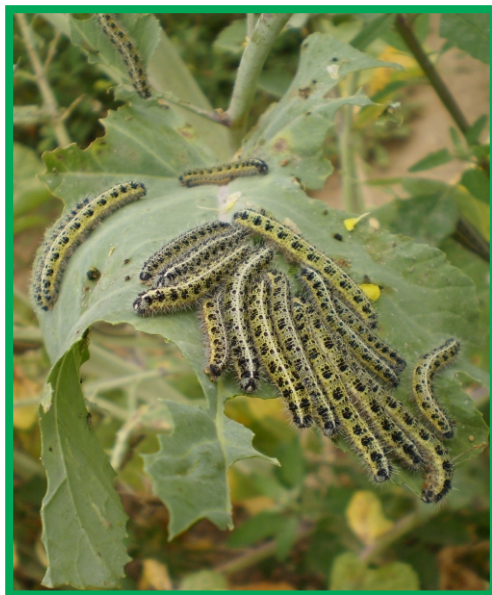
Plate 5: Cabbage Caterpillar