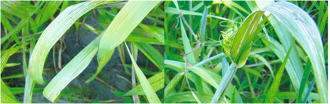
Plate 1 : Manganese deficiency