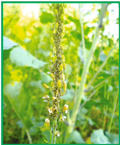
Plate 4: Mustard Aphid