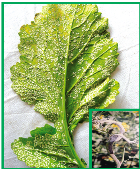
Plate 7: White Rust