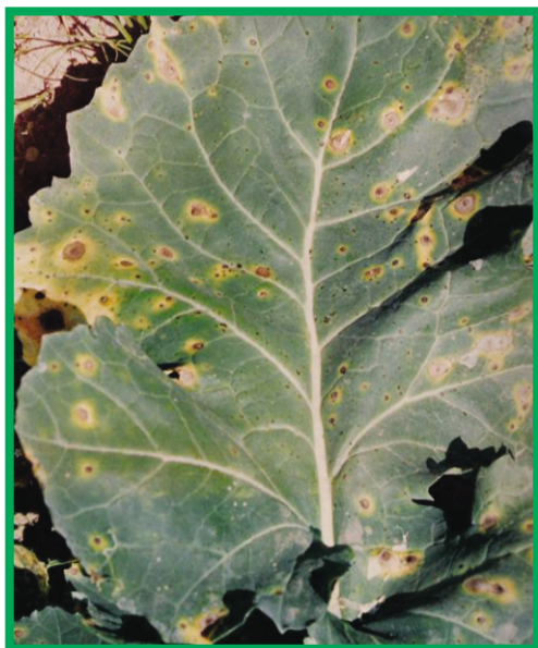
Plate 6: Alternaria Blight