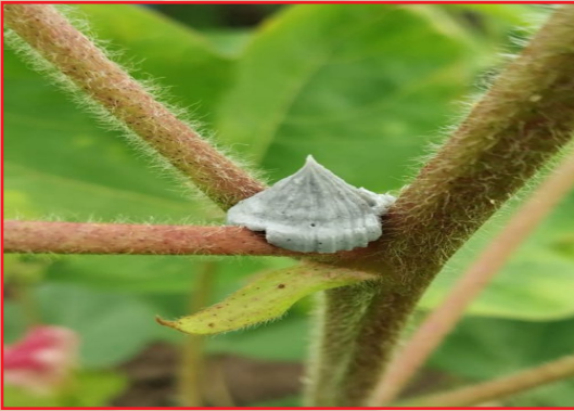
Plate 1: Site of dollop application