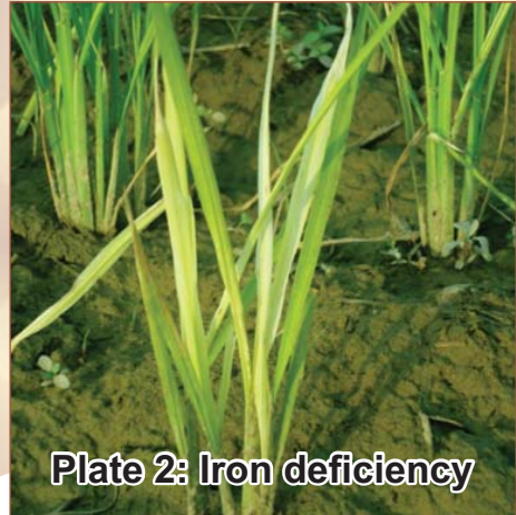
Plate 2: Iron deficiency