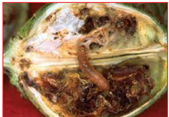
Plate 4: Attack of pink bollworm