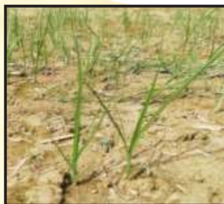
Chatri wala motha