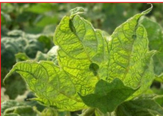
Plate 5: Symptoms of leaf curl disease