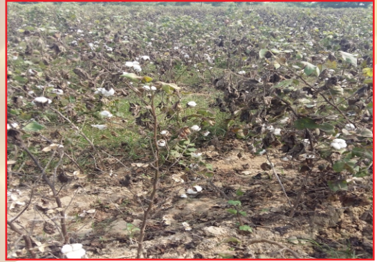
Plate 2: Attack of whitefly