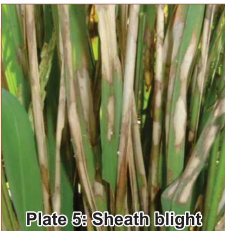
Plate 5: Sheath blight