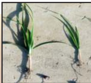
Gandi wala motha