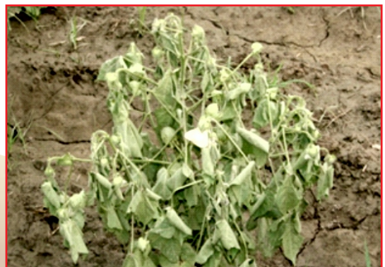
Plate 6: Parawilt