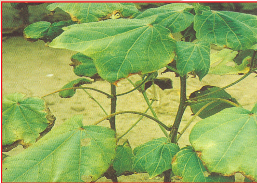
Plate 3: Attack of jassid