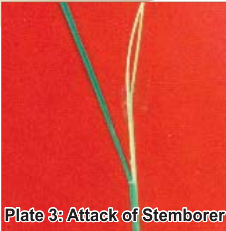
Plate 3: Attack of Stemborer