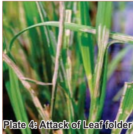
Plate 4: Attack of Leaf folder